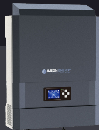
IMEON 3.6 Up to 4kWp Single phase