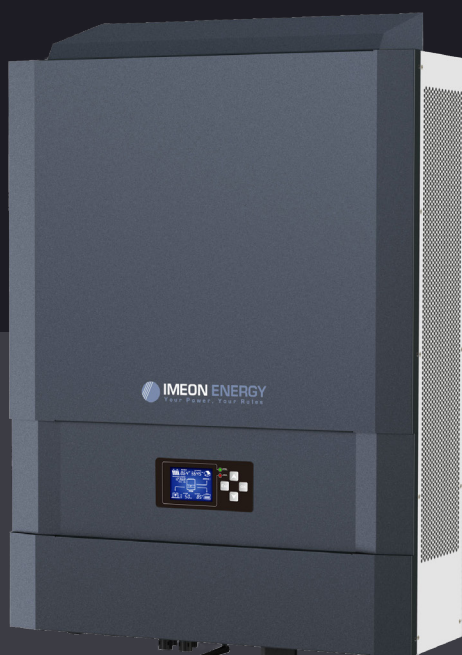
IMEON 9.12 Up to 12kWp Three phase